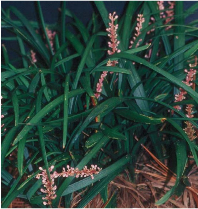
Liriope exiliflora 'Samantha'