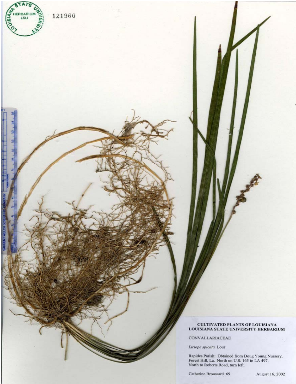
Figure 4.18 Herbarium Mount of Liriope spicata