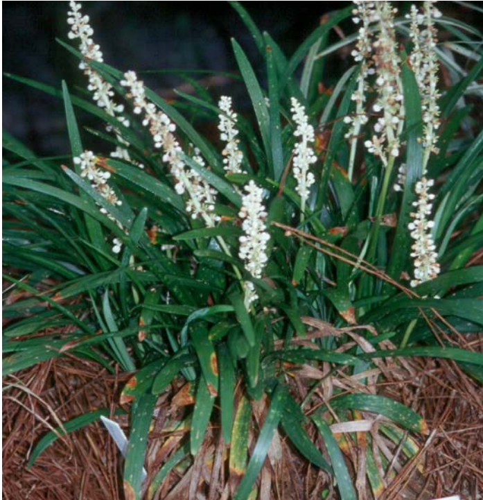
Liriope muscari 'Monroe White'