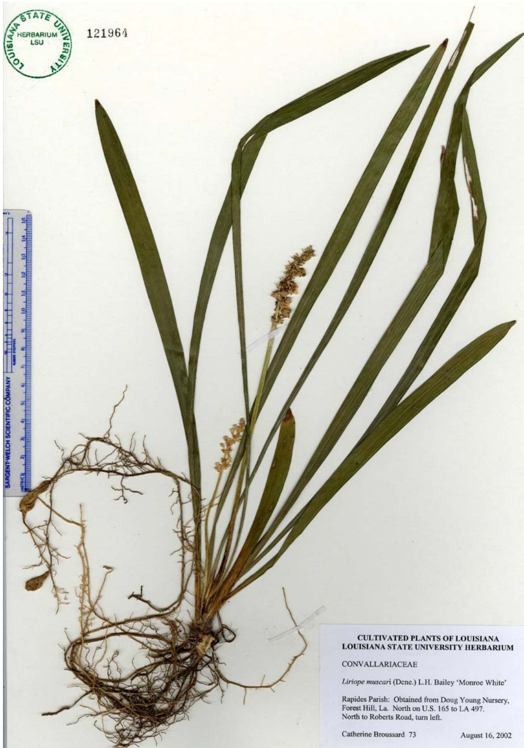
Figure 4.13 Herbarium Mount of Liriope muscari 'Monroe White'