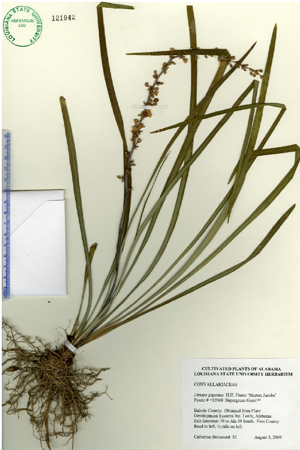
Figure 4.19 Herbarium Mount of Liriope gigantea 'Merton Jacobs' Supergreen™