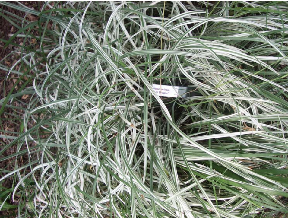
Liriope spicata 'Silver Dragon'