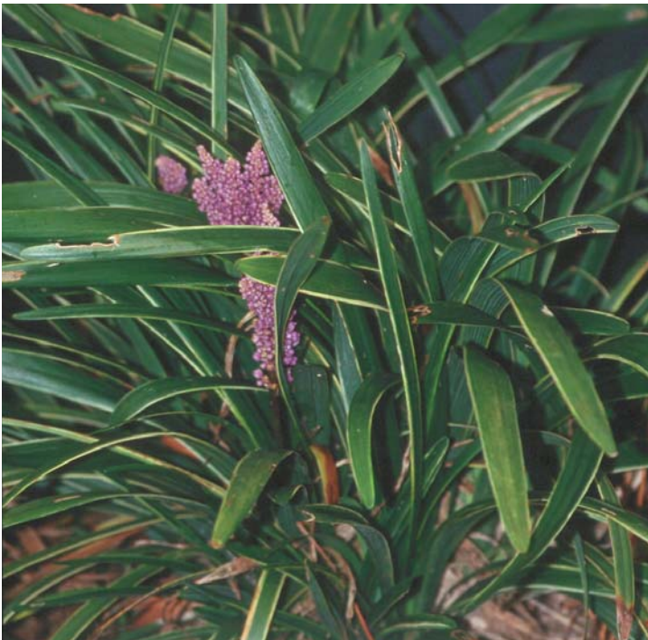
Liriope muscari 'Silvery Midget'