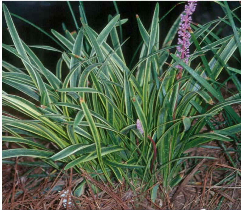
Liriope muscari 'Variegata'