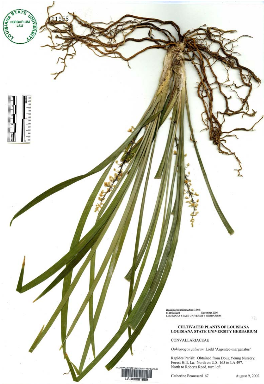
Figure 4.3 Herbarium Mount of Ophiopogon intermedius