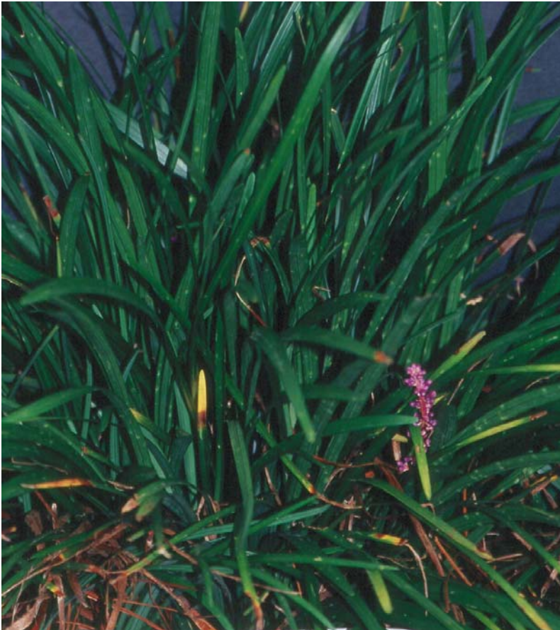
Liriope muscari 'Densifolia'