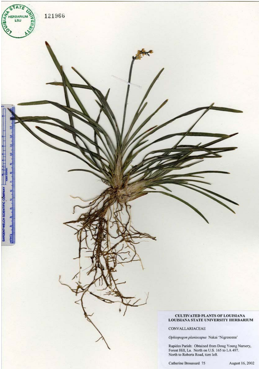
Figure 4.10 Herbarium Mount of Ophiopogon planiscapus