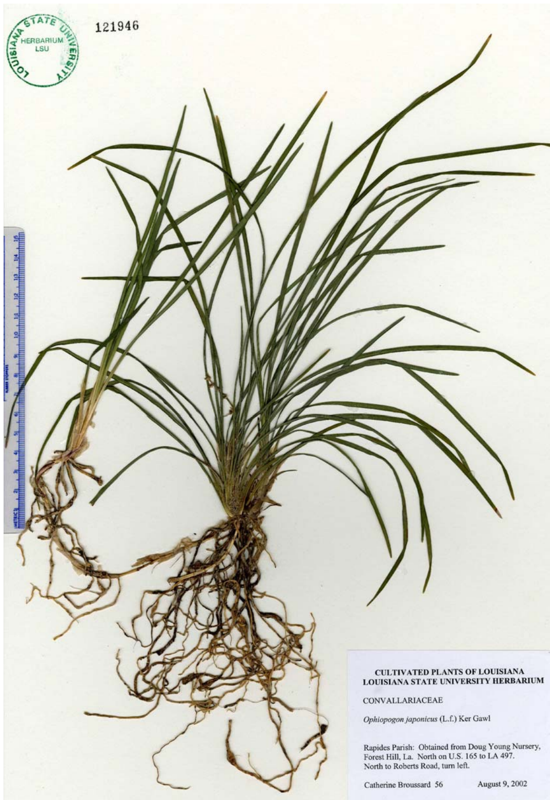
Figure 4.9 Herbarium Mount of Ophiopogon japonicus .