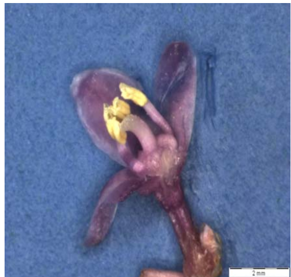
Figure 4.2 Liriope flower.