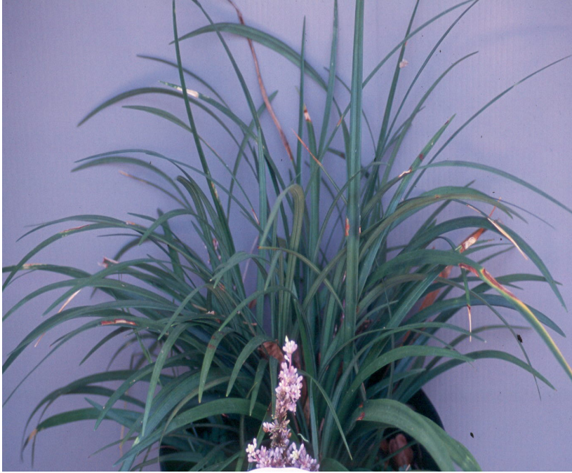
Liriope gigantea 'Evergreen Giant'