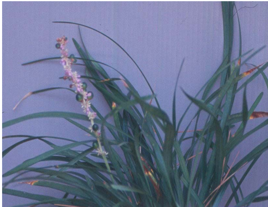
Liriope muscari 'Big Blue'