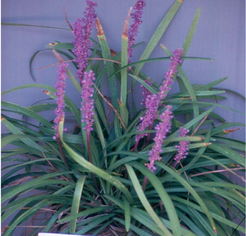
Liriope muscari 'Royal Purple'