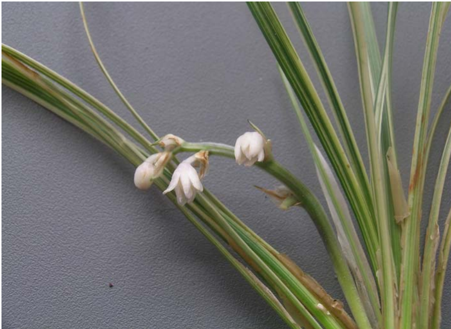
Ophiopogon japonicus 'Silver Mist'