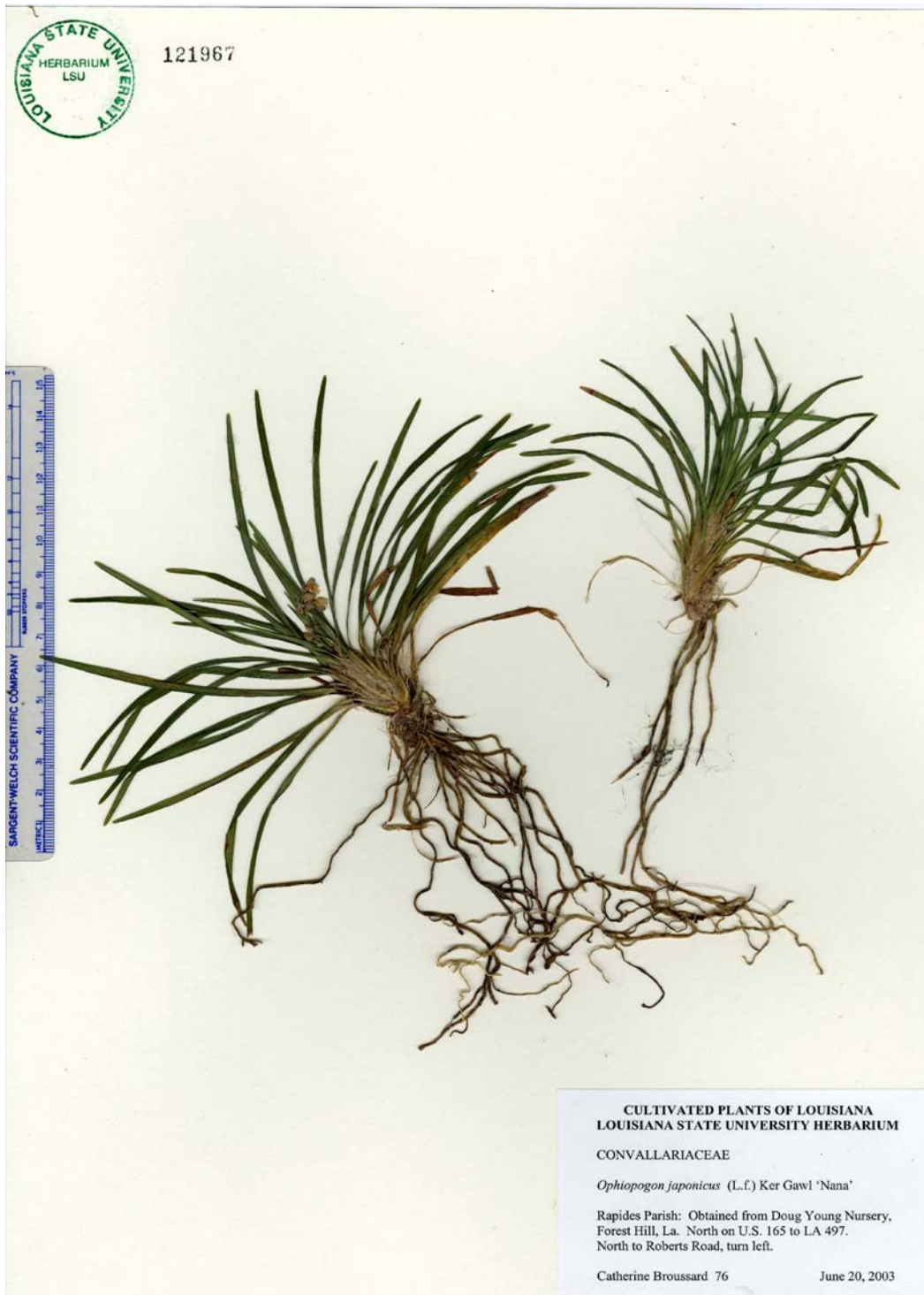
Figure 4.11 Herbarium Mount of Ophiopogon japonicus 'Nana'