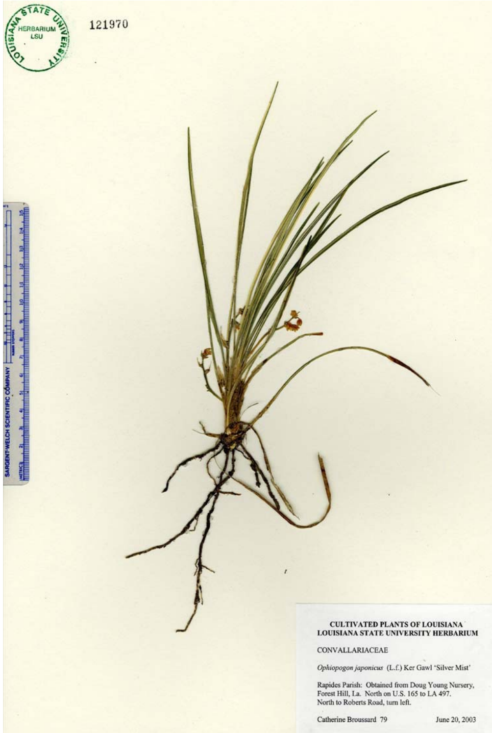
Figure 4.12 Herbarium Mount of Ophiopogon japonicus 'Silver Mist'