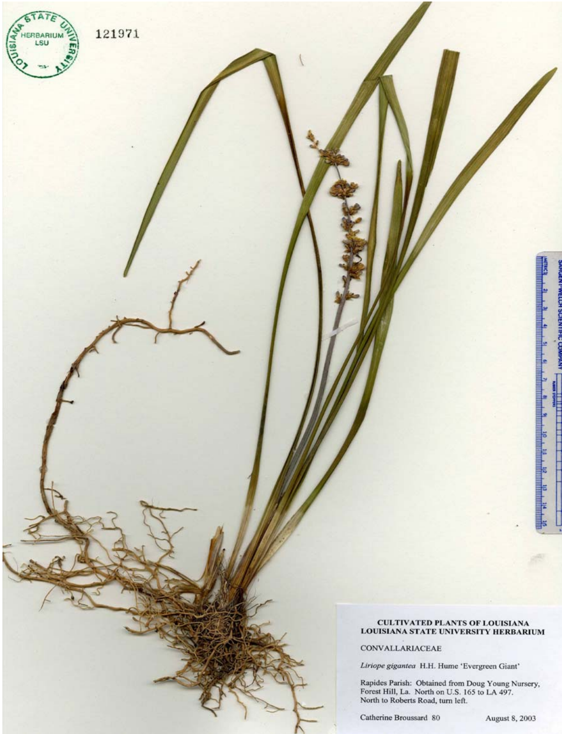
Figure 4.7 Herbarium Mount of Liriope gigantea 'Evergreen Giant'.