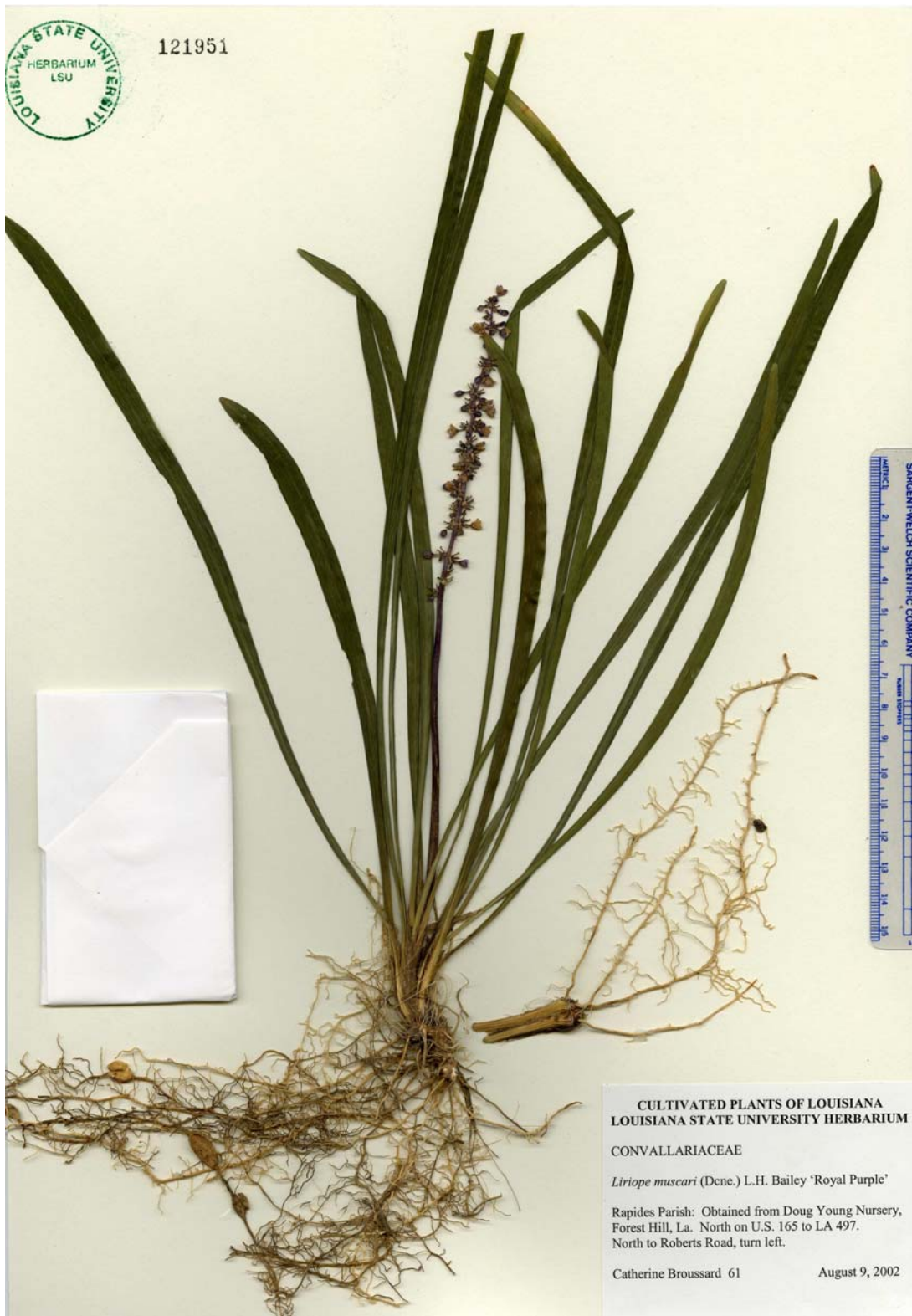
Figure 4.14 Herbarium Mount of Liriope muscari 'Royal Purple'