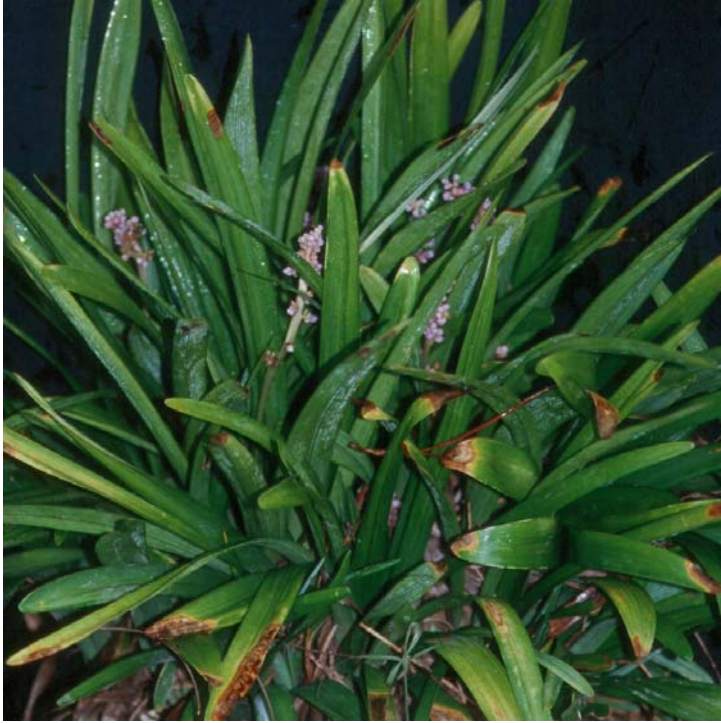
Liriope muscari 'Wideleaf Webster'