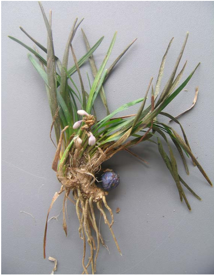
Ophiopogon japonicus 'Nana'