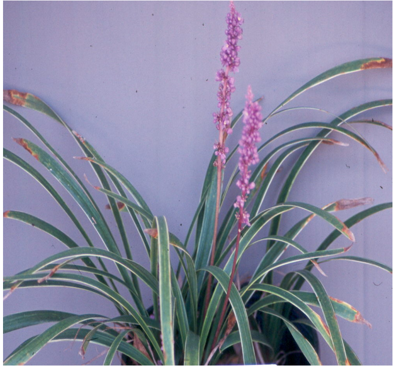
Liriope muscari 'John Burch'