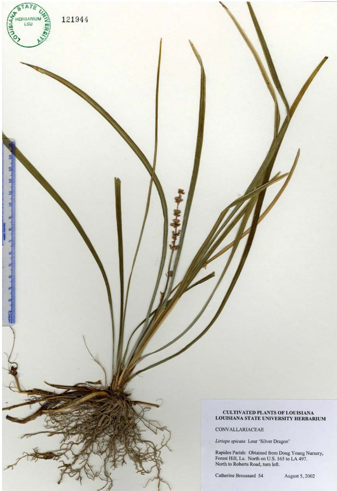
Figure 4.16 Herbarium of Liriope spicata 'Silver Dragon'