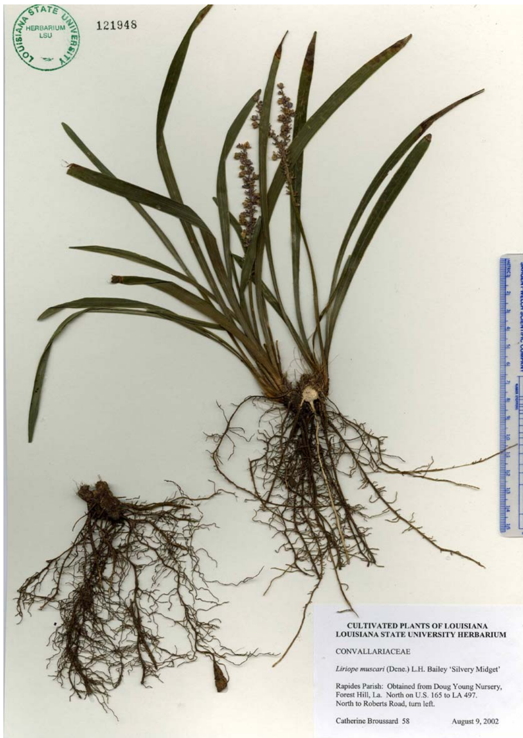
Figure 4.17 Herbarium Mount of Liriope muscari 'Silvery Midget'