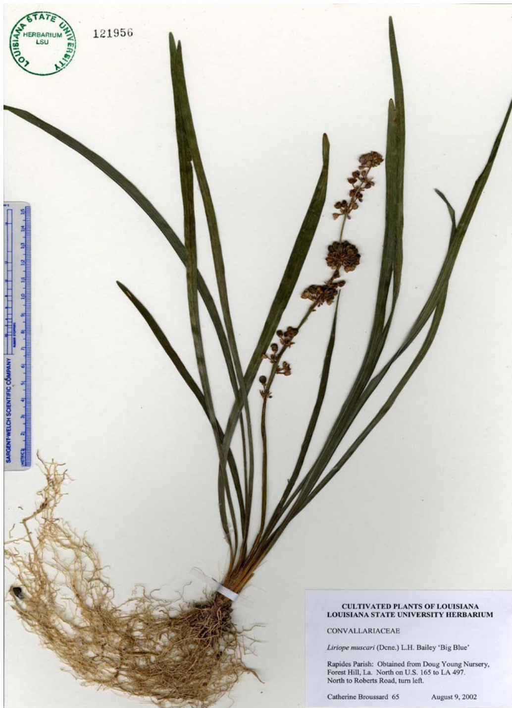
Figure 4.4 Herbarium Mount of Liriope muscari 'Big Blue'