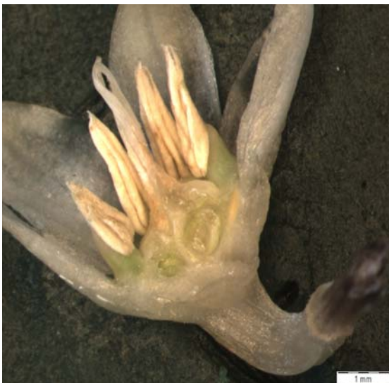
Figure 4.1 Ophiopogon flower

Each cultivar will be individually described as to classification according to the morphological findings in this research which related to the descriptions of Bailey (1929), Hume (1961), Skinner (1971), Fantz (1994), and Cutler (1992). The herbarium mount will follow the plant description after the table of results (Figures 4.3 - 4.21). Pictures of the fresh plants are Appendix C. Morphological characteristics are genera and species specific in the pictures of dissections of Liriope and Ophiopogon flowers (Figure 4.1 and Figure 4.2). Dissections show ovary insertions and stamen filaments. Through anatomical and molecular studies, Cutler (1992) and Mcharo et al., (2003) respectively, place Ophiopogon and Liriope as possibly one genus. Morphological characteristics are used in this study for the green industry professionals. The nurseryman wants a technique of identifying genera and species to ensure consistency (R. Odom, personal communication, 2005).