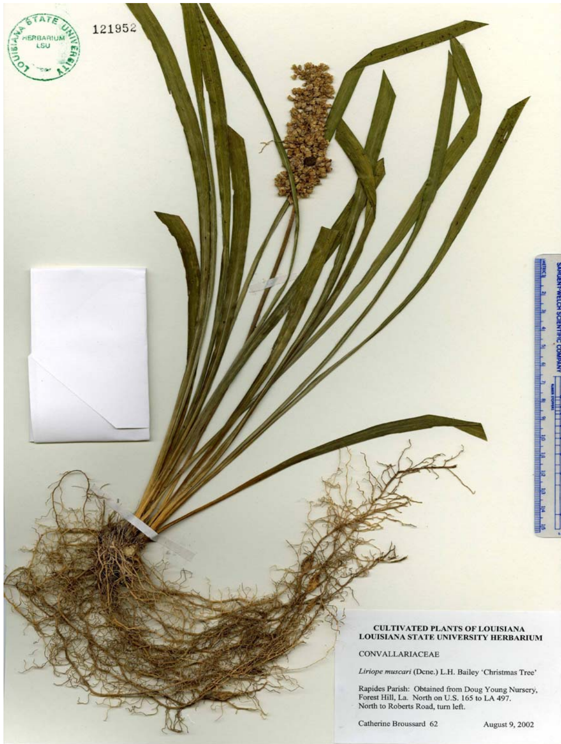
Figure 4.5 Herbarium Mount of Liriope muscari 'Christmas Tree'