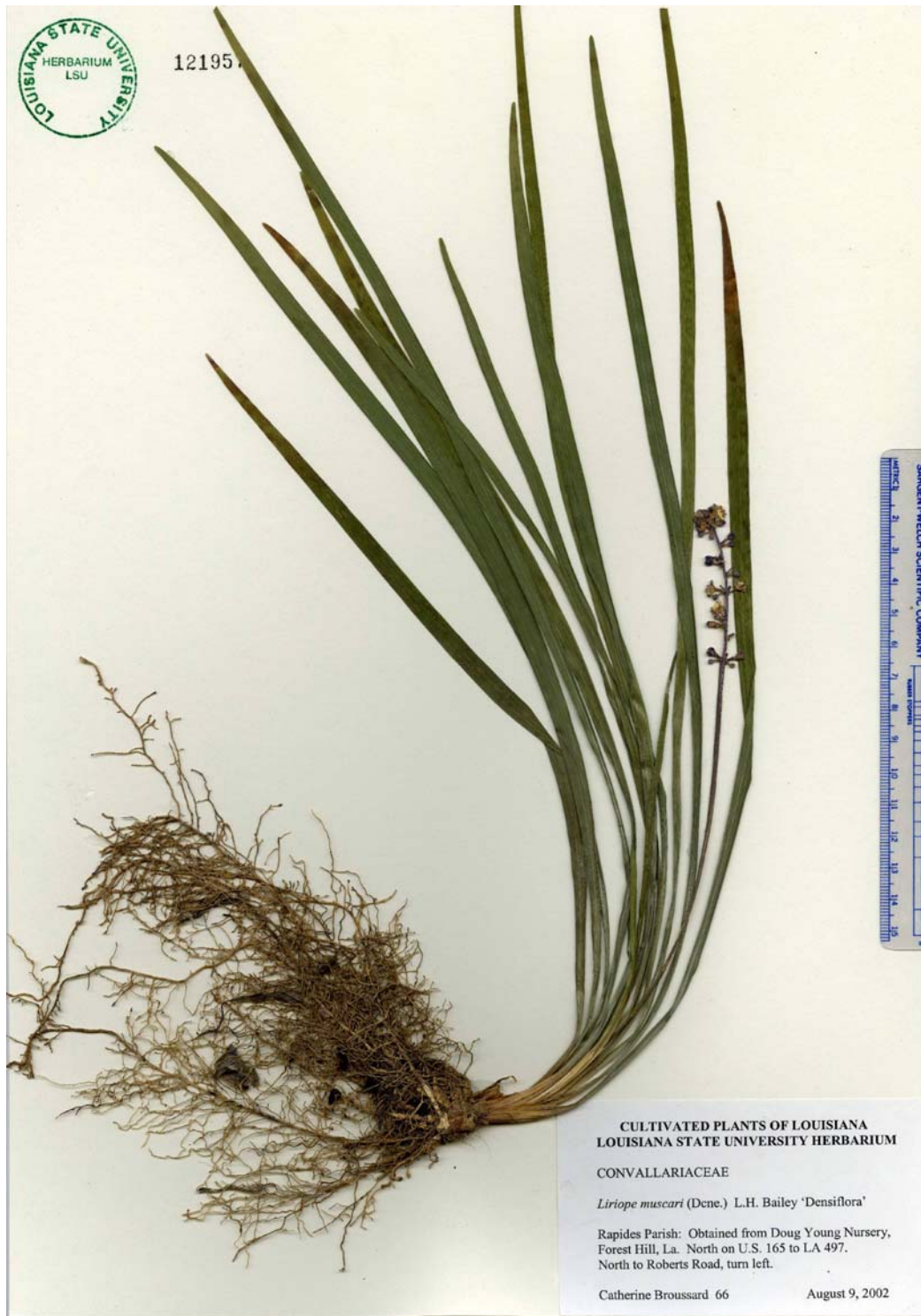
Figure 4.6 Herbarium Mount of Liriope muscari 'Densiflora'.